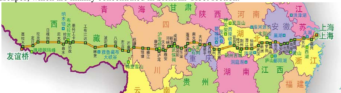
Figure 1. Full Map of National Highway 318